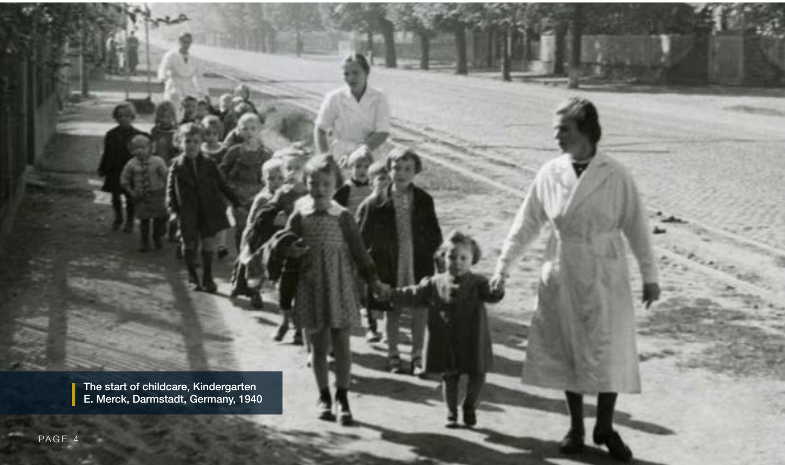
The start of childcare, Kindergarten E. Merck, Darmstadt, Germany, 1940